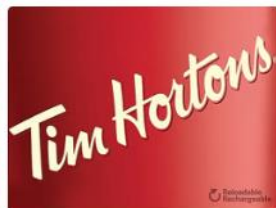
TIM HORTONS Gives 1%