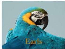
EARLS KITCHEN + BAR Gives 2%