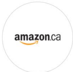
AMAZON.CA GIFT CARDS Gives 1%

I use the App regularly, so if you have questions about “The Hows” etc, by all means, send me an email, and I will help with your questions. In the meantime, based on your location in Canada, please stay safe, and enjoy your gradual openings as they are occurring in your Province!! Hopefully, we will be bowling soon.