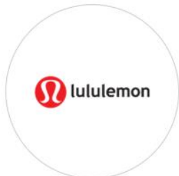
LULULEMON ATHLETICA Gives 2%