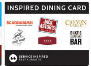
INSPIRED DINING CARD Gives 10%