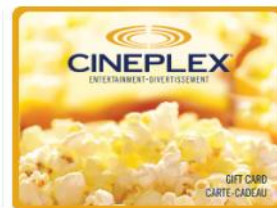
CINEPLEX Gives 3%