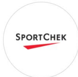
SPORT CHEK Gives 3%