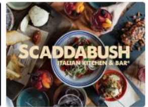
SCADDABUSH ITALIAN KITCHEN & ... Gives 10%

To join up, download the Flipgive app, or visit www.flipgive.com/join Remember, the CTF Team Canada code is IRFPW9