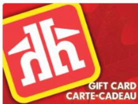
HOME HARDWARE Gives 2%

Below is a list of Common gift cards, and the percentage that is donated to CTF.