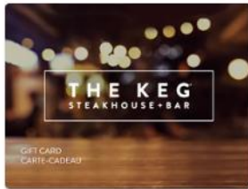
THE KEG STEAKHOUSE + BAR Gives 5%