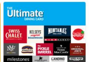
THE ULTIMATE DINING CARD Gives 7%

Here are some of the Dining Out options available – Remember, you can order Take-Out and pick up at most locations. Gift Cards typically need to be used in Store, unless they are linked to an APP.