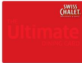
SWISS CHALET Gives 7%