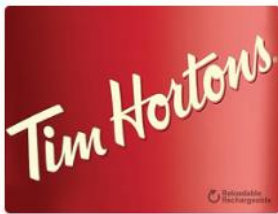
TIM HORTONS Gives 1%