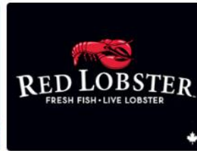
RED LOBSTER Gives 1%